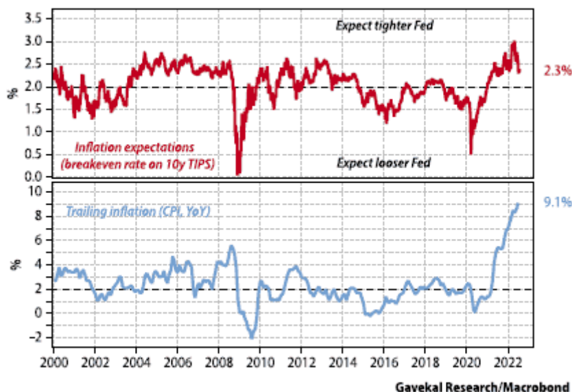
Market inflation expectations are moderating; trailing inflation is not

1) Fed chairman Jay Powell has repeatedly stated that the “ultimate goal” of monetary policy is well-anchored inflation expectations. The Fed’s average 2% target for trailing inflation is merely a means to that end (see This Is Not Arthur Burns’ Fed ). This puts the emphasis on inflation expectations.