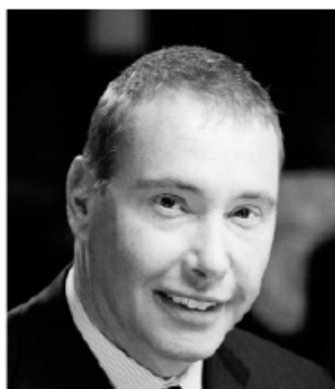
FIGURE 1: INVESTMENT PROFILES