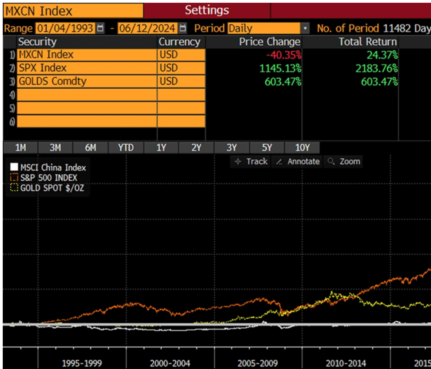
Chart of the MSCI (Morgan Stanley China vs the S&P and Gold

The fact that this period mostly represented extraordinary Chinese economic growth, until recent years, renders it almost incomprehensible. Similarly, the fact that Apple, Microsoft and Nvidia alone are worth more than the entire Chinese stock market — over nine trillion versus 7.8 trillion — is another jaw-dropper.